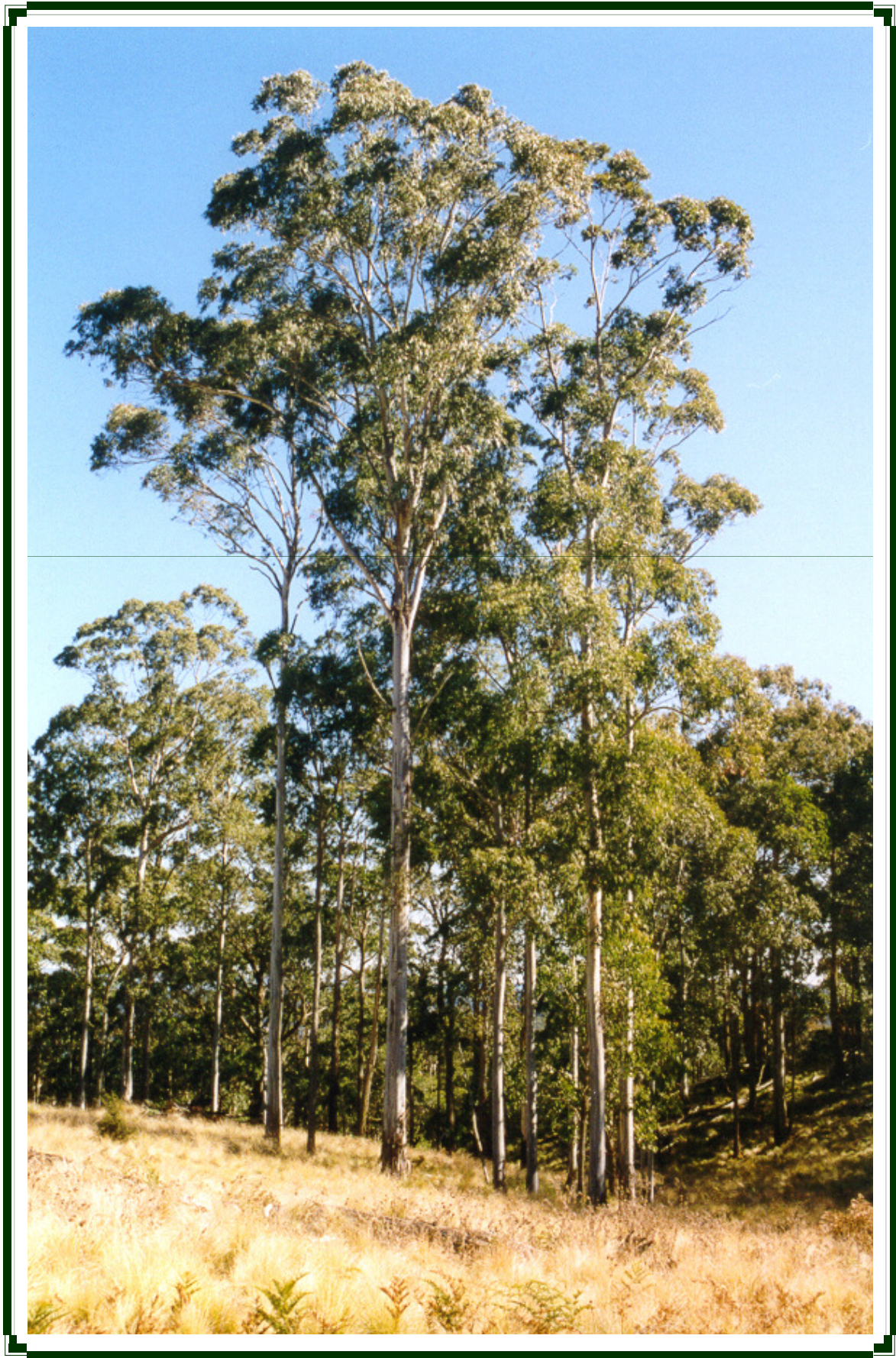
Economic Benefits from Native Forestry in the Region